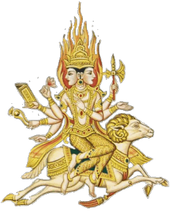
Title: Vahini are gallery. Site: http://vahini.org/gallery/hall4/platejeshall4/agni.gif

Then Hanuman seeks out and checks on Ravana, Hanuman tells Ravana and they find loving Sita which was took by Ravana!